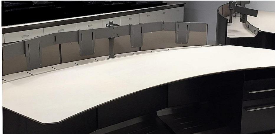
Foldable screen support

VESA plates sliding on the support allow the monitors to be positioned and locked. Setting allowing lateral positioning of the monitors. Setting allowing the monitors to be tilted together to provide an ideal viewing position. Adaptable to the worktop and ceiling or wall hanging fixtures.