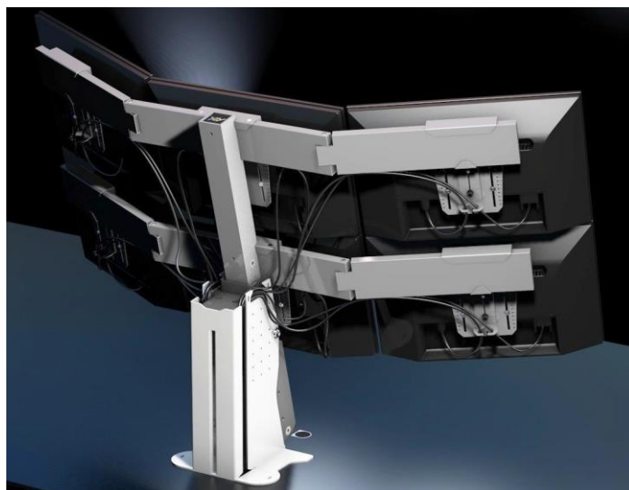
Electrically-controlled screen XYZ support system (raising, lowering, tilt)