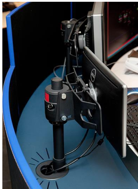
X&Y attached to worktop